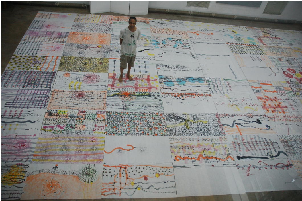
Beijing Studio View 北京工作室 2010

The suite of paintings to be exhibited reflect on Lewis's journey from his birthplace in Jamaica, his studies in California and his current work as an educator in Boston. They are infused with jazz, influenced by the artist's African – American heritage and infected by the cacophony that is Beijing. Rich in color, these abstract constructions promise to gently calm the viewer's anxieties by immersing them in a playground of visual pleasure.